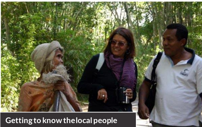
Getting to know the local people