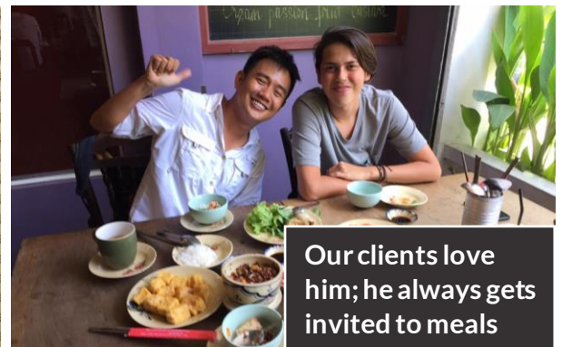
Our clients love him; he always gets invited to meals